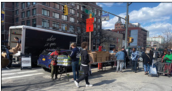
Isaacs/Holmes Outreach - March 15